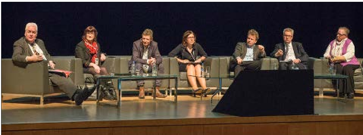
Panel for the session on Big Data.

collaboration in respect of much-needed guidelines in the fast-developing field of personalised medicine